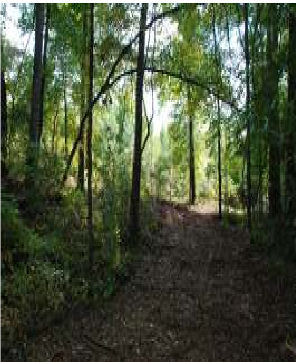
New Photos of firebreaks along creek bottom.