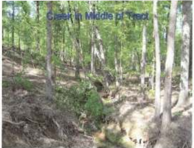
Creek in Middle of Tract